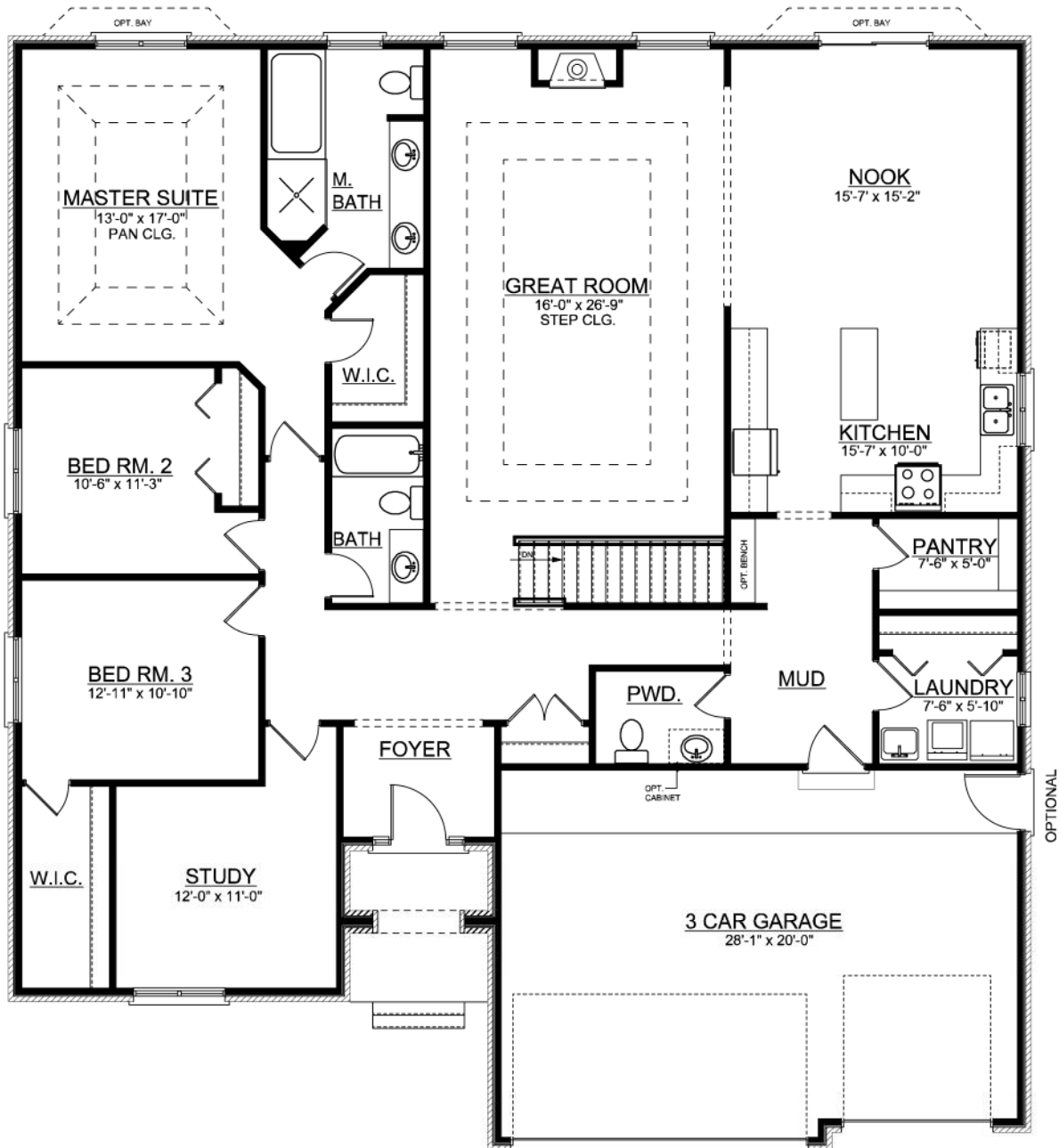
FIRST FLOOR PLAN 3 BEDROOM & STUDY OPTION

PHOTOGRAPHS RENDERINGS AND FLOOR PLANS ARE FOR PRESENTATIONAL PURPOSES ONLY AND MAY NOT REFLECT THE EXACT FEATURES OR DIMENSIONS OF YOUR HOME. FLOOR PLANS AND DESIGNS ARE COPYRIGHTED ©2019 D'ANNA ASSOCIATES LTD.