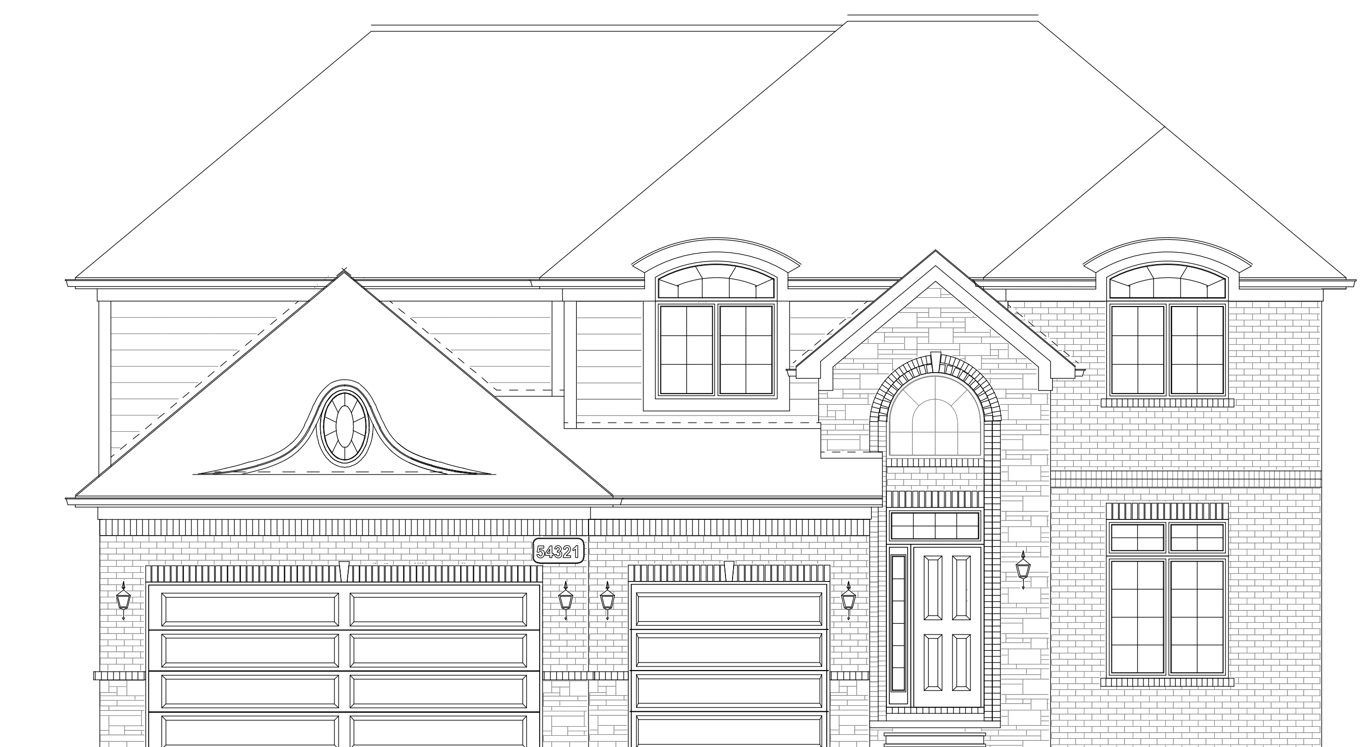
"C" FRONT ELEVATION