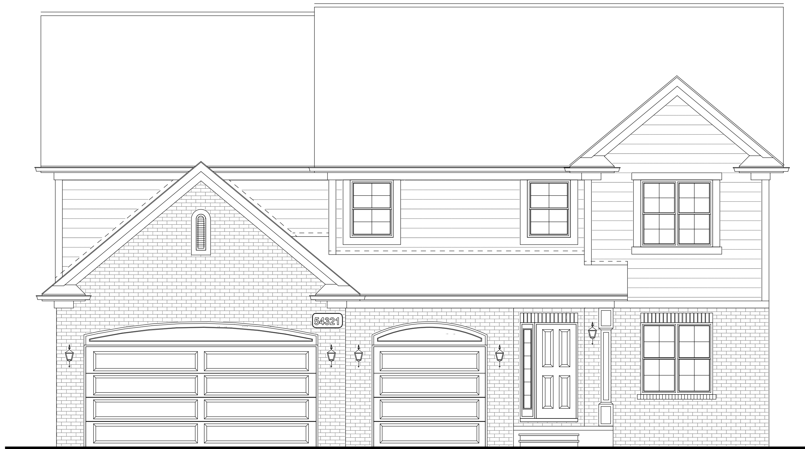
"A" FRONT ELEVATION